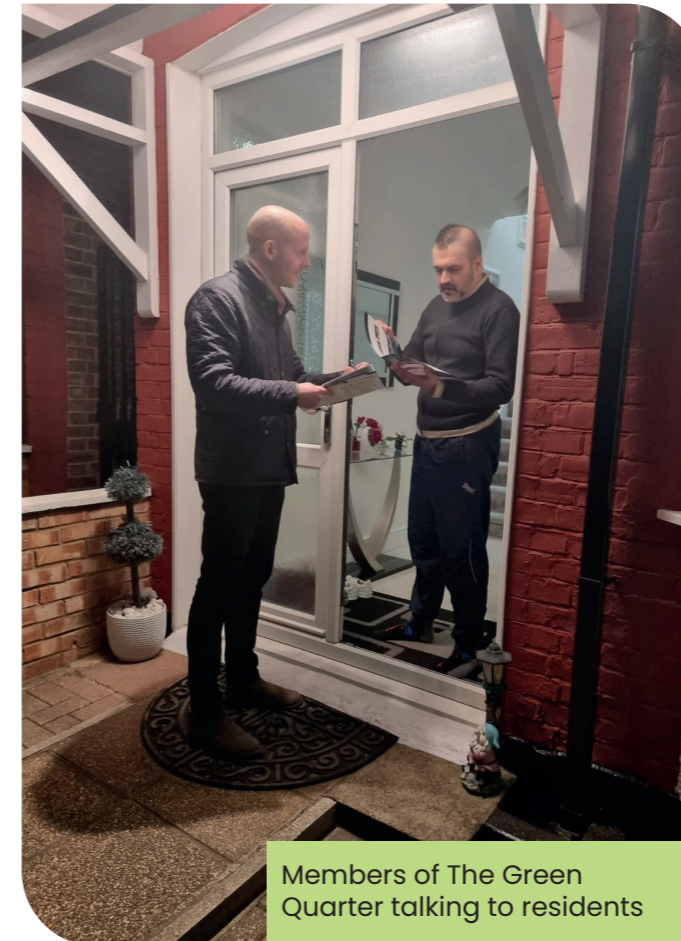
Members of The Green Quarter talking to residents

The group will advise on community activities, events, partnerships, and projects. It will also be responsible for managing the Community Chest Programme which will help to give grants to worthwhile causes.