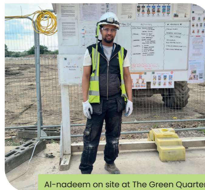
Al-nadeem on site at The Green Quarter