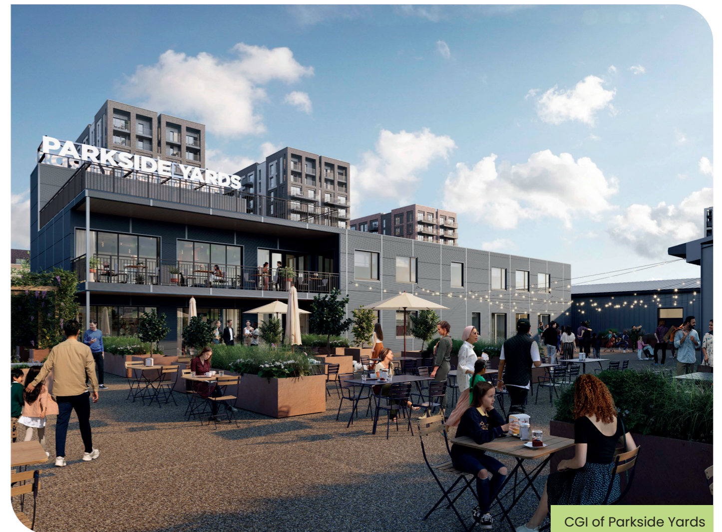
CGI of Parkside Yards