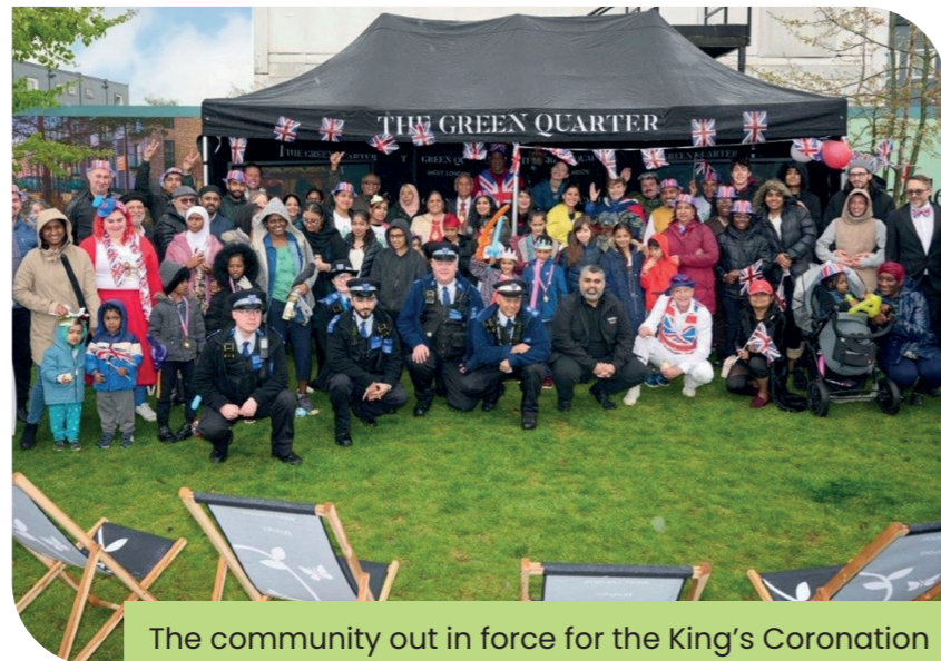
The community out in force for the King's Coronation

In spite of the rain, we had ourselves a Right Royal Knees Up to celebrate The King's Coronation. We'd love to thank each and everyone of you who showed up to watch this momentous occasion. The event, which was attended by over 150 people, featured games, music, face painting and a food & beverage offering.