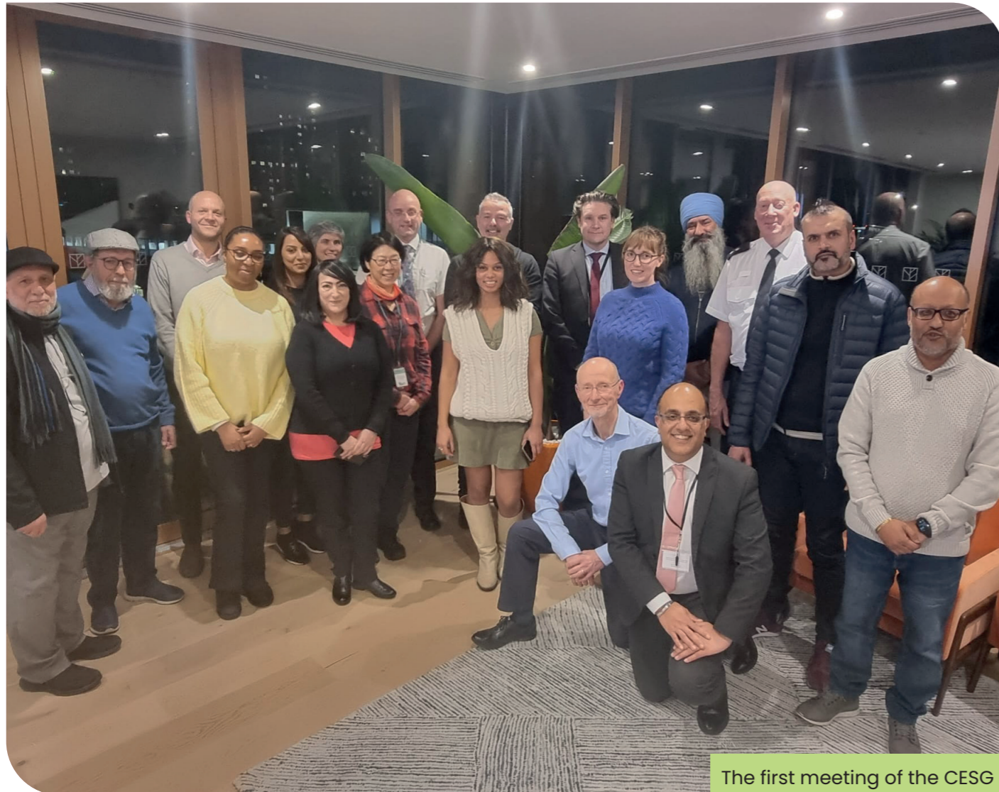
The first meeting of the CESG

We are delighted to introduce our new Community Engagement Steering Group (CESG). The purpose of the group is to strengthen relationships with the local community and work collaboratively to ensure The Green Quarter delivers for local people. The CESG is made up of representatives from the local community including business owners, residents, and community organisations.