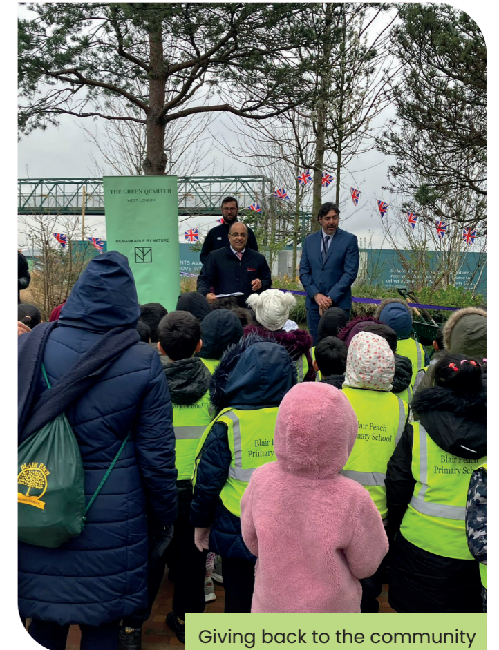
Giving back to the community

To read the full report visit www.thegreenquartercommunity.co.uk