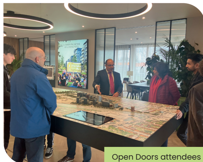
Open Doors attendees