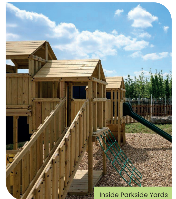
Inside Parkside Yards

Parkside Yards will be launching Saturday 24 th June, for more details visit parksideyards.com