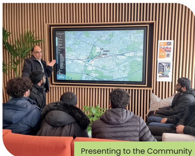
Presenting to the Community

This was an opportunity for the community to come and visit the development and get a behind-the-scenes look at the inner workings of a construction site. It also gave us a chance to introduce locals to our wonderful team, share our long term vision for Southall and show residents our future plans for The Green Quarter.