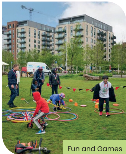
Fun and Games