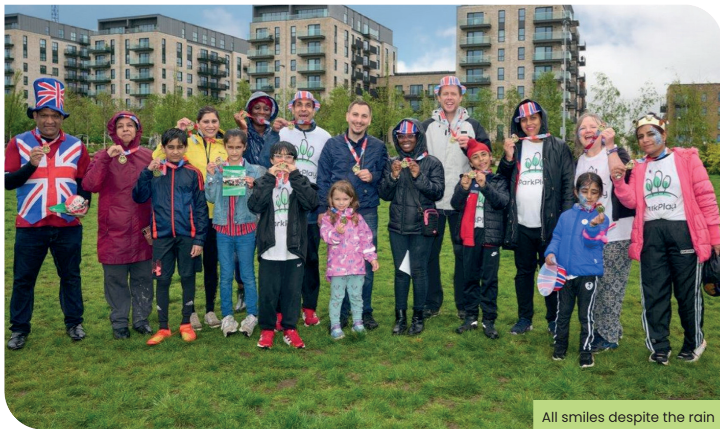
All smiles despite the rain