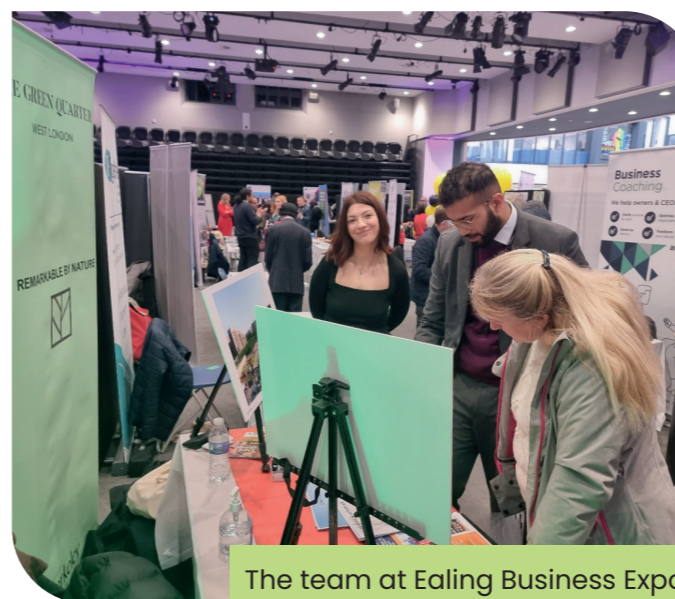
The team at Ealing Business Expo