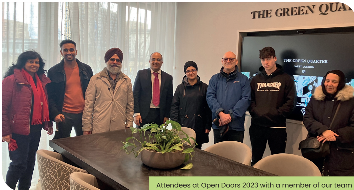
Attendees at Open Doors 2023 with a member of our team

We were once again delighted to welcome the community to see behind the scenes at The Green Quarter for the annual Open Doors event.