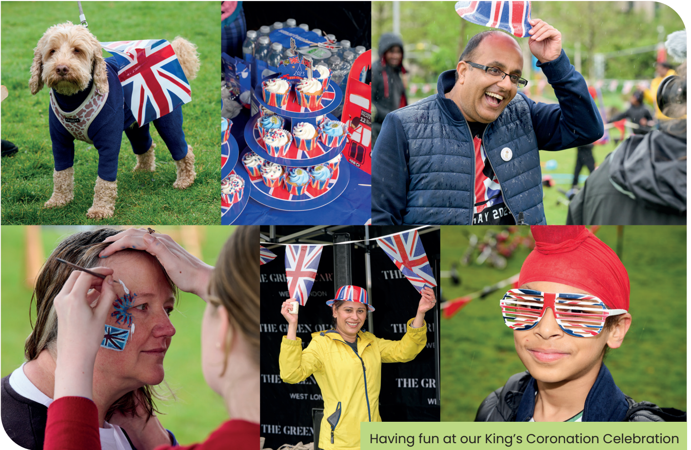
Having fun at our King's Coronation Celebration