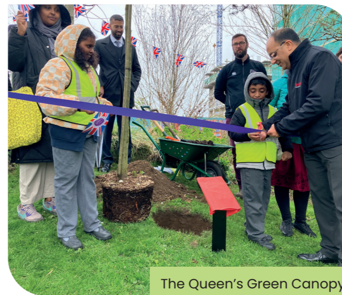
The Queen's Green Canopy

In spite of the rain, we had ourselves a Right Royal Knees Up to celebrate The King's Coronation. We'd love to thank each and everyone of you who showed up to watch this momentous occasion. The event, which was attended by over 150 people, featured games, music, face painting and a food & beverage offering.